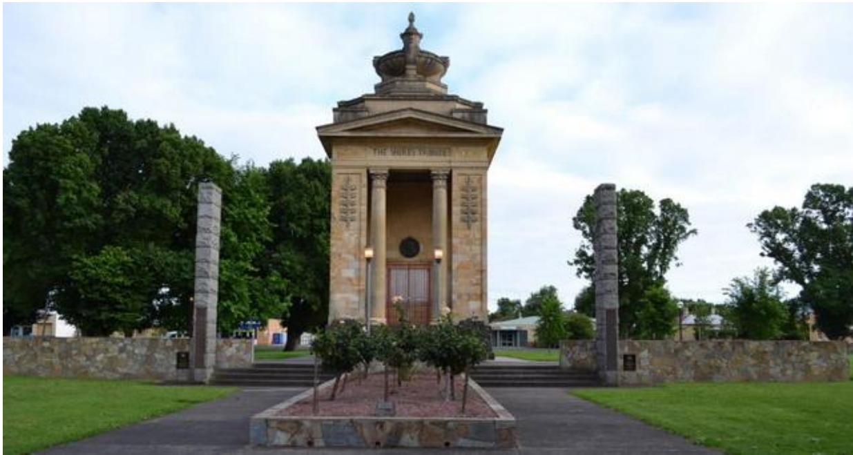
Colac War Memorial