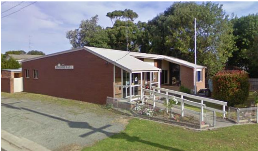
Apollo Bay R.S.L.