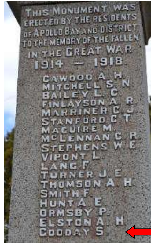
Apollo Bay War Memorial (Photos from Carol's Headstone Photographs )